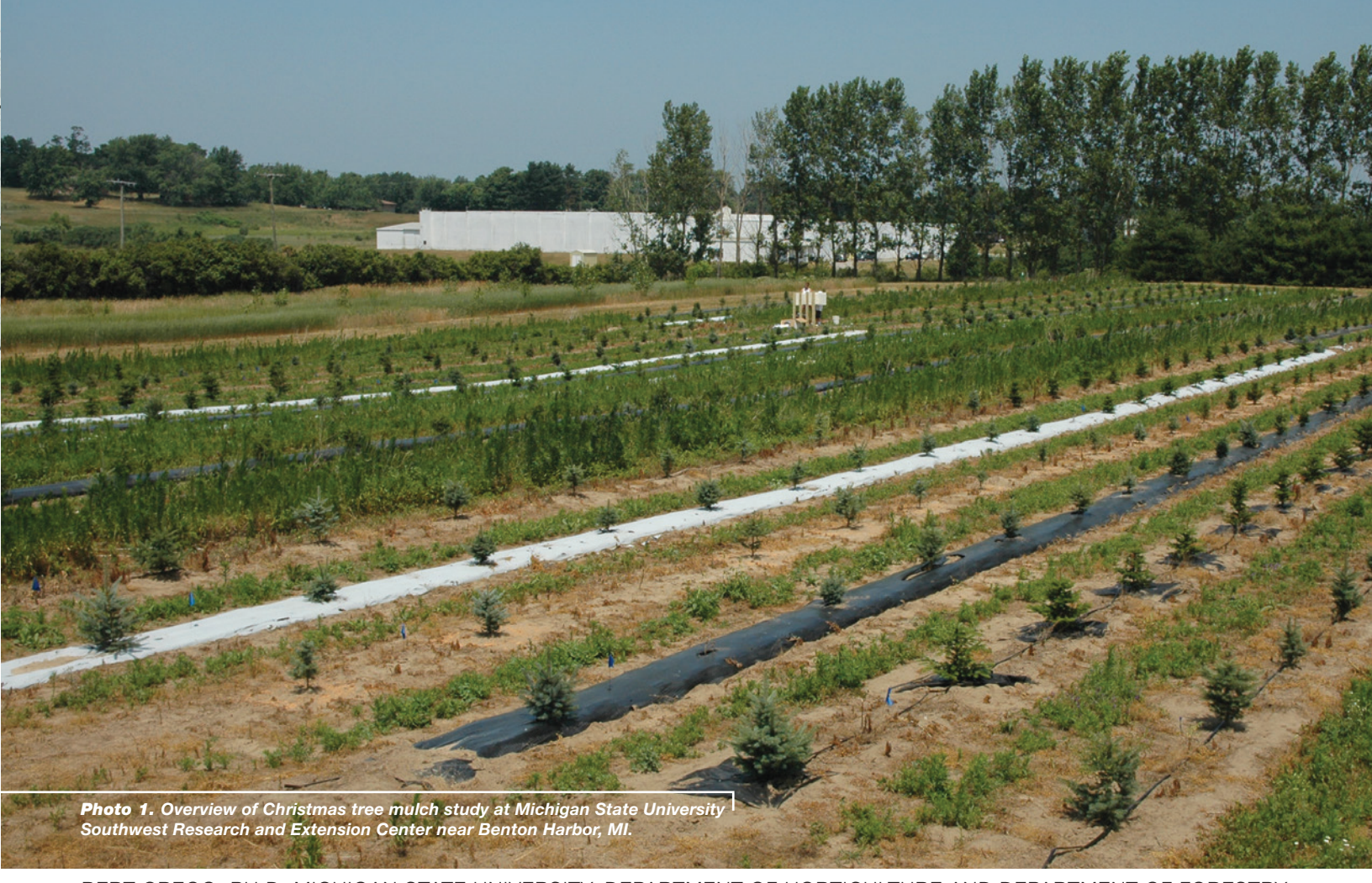
BERT CREGG, PH.D. MICHIGAN STATE UNIVERSITY, DEPARTMENT OF HORTICULTURE AND DEPARTMENT OF FORESTRY

The use of organic mulches such as ground bark or wood chips is a common practice in managing trees and shrubs in landscapes. Mulches can provide a range of benefits including weed control, soil moisture conservation, and addition of soil organic matter. Because of the widely recognized benefits of mulch for trees in landscapes, the question of using mulch for Christmas trees often arises among growers. In fact, numerous recent posts on the Great Lakes Christmas Tree Growers Facebook group have touched on the topic of mulch in Christmas trees. In this article, I will draw from some of our past research at Michigan State University and discuss some of the positive aspects of mulch as well as some of the potential negative impacts of mulch in Christmas trees.