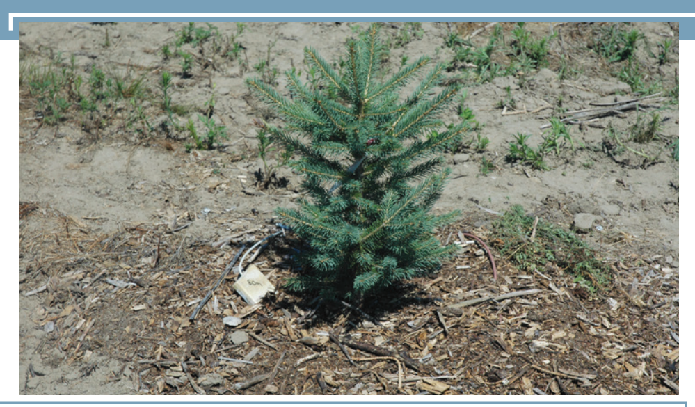
Photo 2. Close-up of wood chip mulch ring and soil temperature and soil moisture probes.